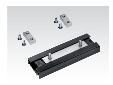
Carriage (with mounting aid) and End Stops have to be ordered seperately.