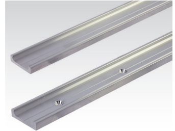
Tracks on choice without bores or with mounting holes.