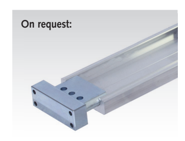
Drilling jig: to drill pinholes for permanent pinned connection of tracks.