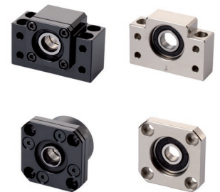
Bearing Units for Spindles page 474